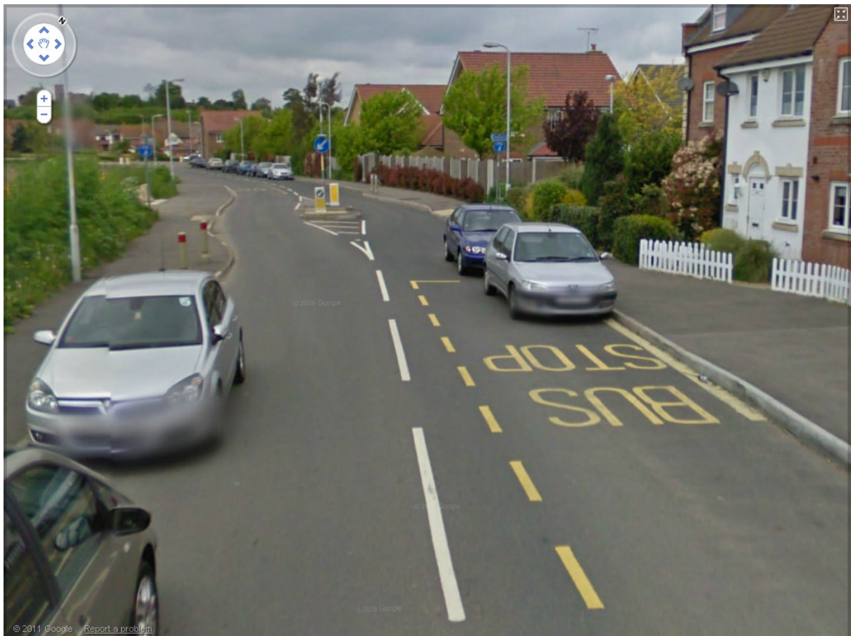
Parking outside existing houses on Jacinth Drive, with commuter parking in background