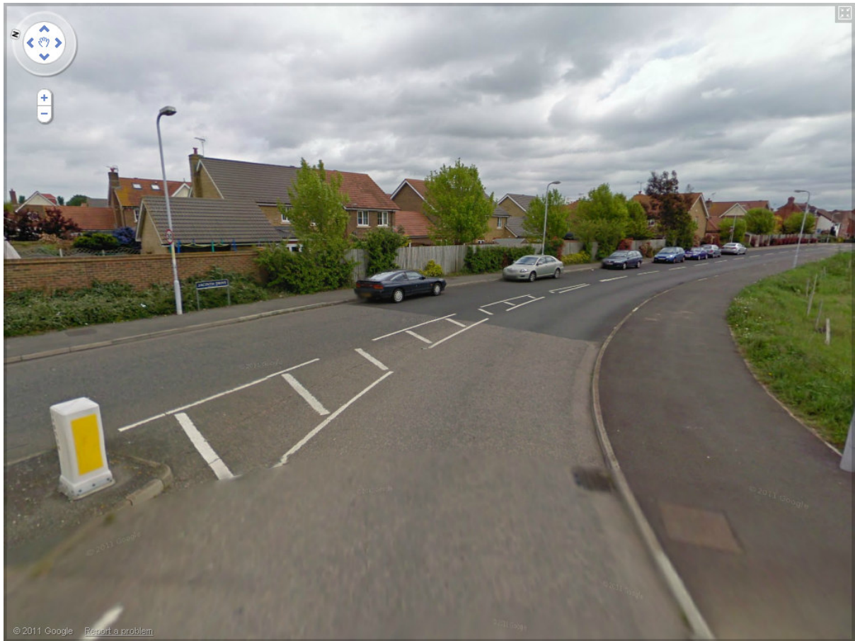
Commuter parking on Jacinth Drive, opposite development site.